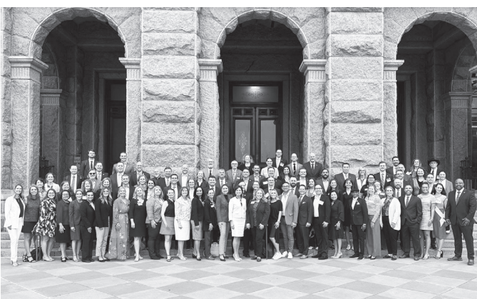
I enjoyed visiting with friends during Collin County Days at the Capitol.

Summary: Our state has spent a good bit of taxpayer funds building the wall along our Mexico border. Because this wall was built on land owned privately by Texans, we had to get their permission to build on their land. However, now local taxing entities are trying to raise the appraised value of that portion of land because of the protective fencing placed on it, even when it takes up what was formally usable agriculturally productive farm or ranch land. This amendment, if passed, would prohibit appraisal districts from over-taxing citizens, who helped secure our state, by allowing the security infrastructure portion of that land to be property-tax exempt.