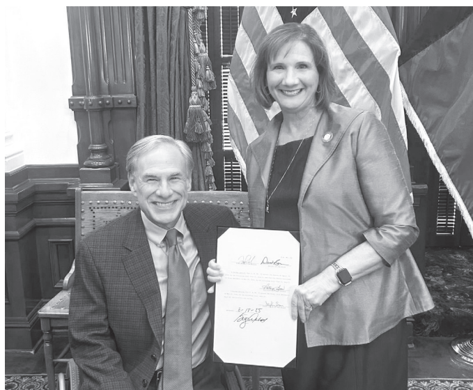
Honored to have Governor Abbott sign all 18 of the bills I carried into law.