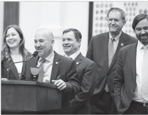
Representative Tepper asks questions from the back microphone of the House Floor.