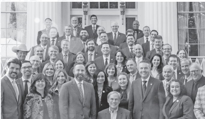
Joint-authors and co-authors of SB 2 join Governor Greg Abbott at the Governors Mansion to celebrate the signing of the landmark school choice legislation.