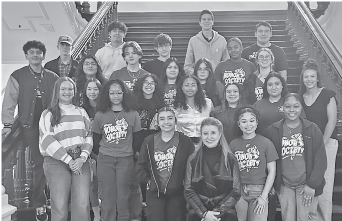
The Anahuac High School Honors Society visiting their State Capitol.