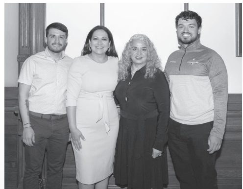
Fito Olivares, the King of Cumbia, sadly passed away in Houston on March 17, 2023 at the age of 75. Fito Olivares ushered in a new era of cumbia and his influence endures to this day. I was proud to author a resolution in the Texas House of Representatives that paid tribute to the memory of Fito Olivares. His family came to the Texas Capitol to be recognized and receive the resolution.

Texas House of Representatives House District 145