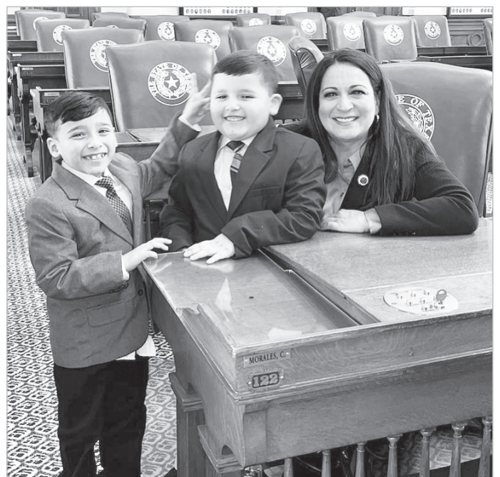
My grandsons came to the Texas Capitol this session to spend the day on the floor. They saw how we vote, how we debate bills, and the work that happens to keep our state government running.