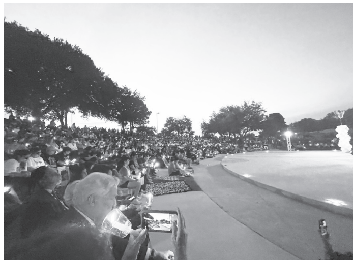
Community vigil honoring the 21 Uvalde shooting victims one year after the shooting at Robb Elementary School.

It transcends race, age, gender, and socioeconomic status. The loss of life and devastating impact that gun violence has is immeasurable and tears families and communities apart. Change is not easy; it requires great amounts of perseverance to challenge the status quo. By fostering empathy, compassion, and a commitment to proactive change, we can work towards a future where students can feel safe and secure in the classroom.