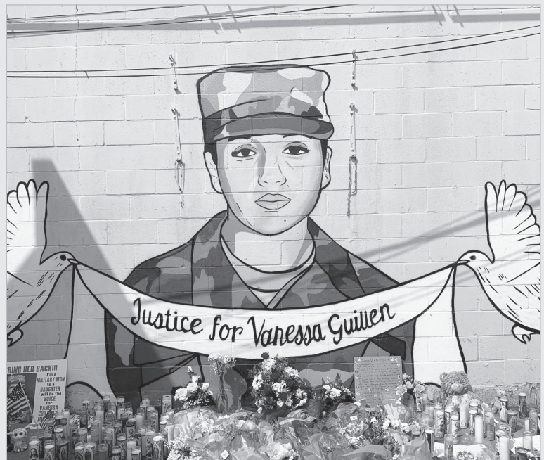
Mural of Vanessa Guillén by Donkeeboy and Donkeemom

Vanessa Guillén was a constituent and community member in House District 145. After discussing with the Guillén family, we began the process of drafting legislation to honor her and to ensure that this tragedy would never happen again.