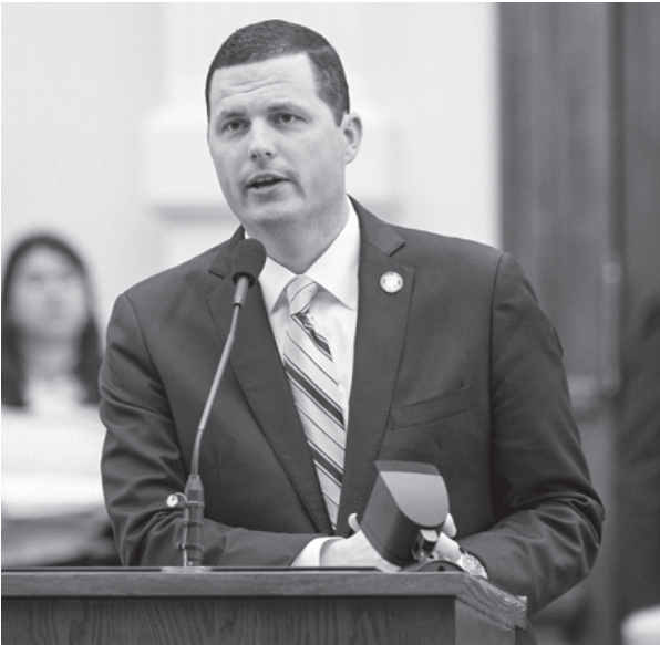
Rep. Patterson questioning the author of a bill on the House floor