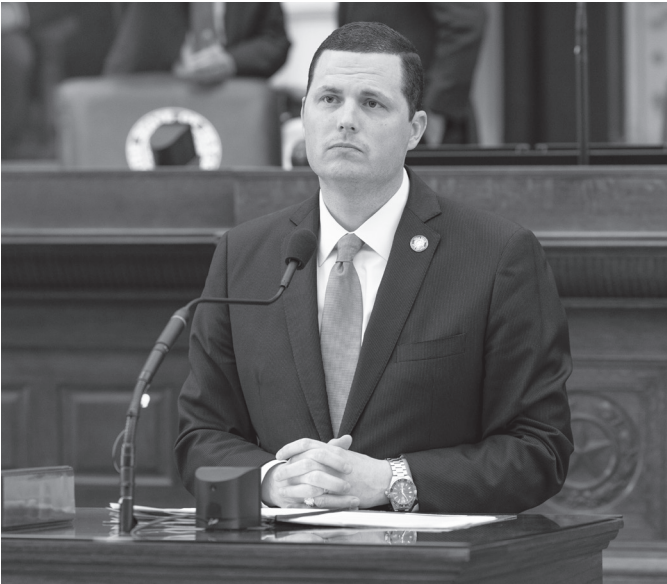
The Representative answering questions about HB 186 - A bill to protect children from the harms of social media.

the necessity of voter registrars to work quickly so that ineligible individuals do not vote when they are no longer legally eligible.