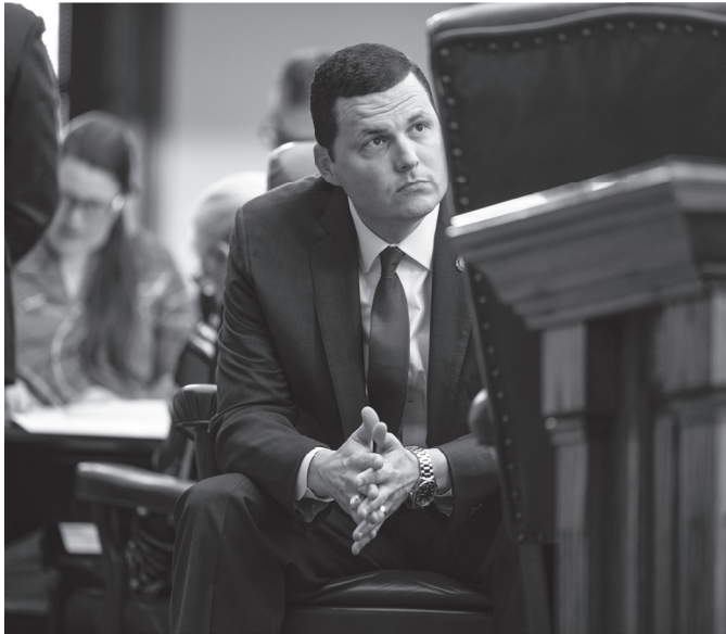
The Representative on the Texas House Floor