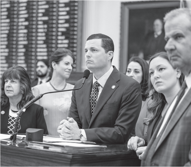
The Representative and his colleagues defending SB 412 - A bill to prevent harmful material from being shown to a child.