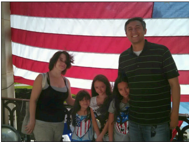
This summer, our family took a long road trip and visited several state capitols (we visited nine in July). It turned out to be a great way to study our nation's history.

"Summer afternoon—summer afternoon; to me those have always been the two most beautiful words in the English language." - Henry James