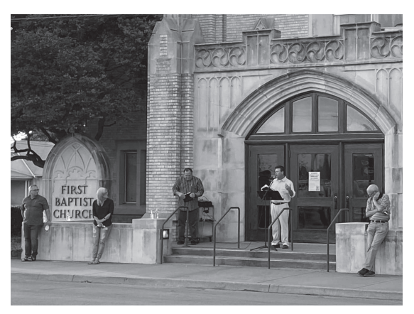
Thank you to everyone that came out for the First Baptist Church Drive-In Prayer Service. It was a privilege to participate in this historic event.