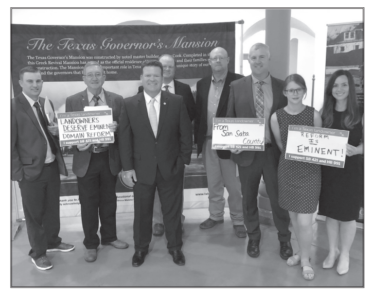
Members of Texas Farm Bureau from across the state to support efforts to reform the eminent domain process and protect private property rights.

The State of Texas gives extra weighted funding as an allotment to school districts for students who are engaged in Career and Technical Education programs, such as high school agriculture classes. This funding finances CTE classes and helps them receive additional materials to further students' education in these fields. Historically, the State Board of Education has ruled that 58% of that allotment must go to direct costs for CTE programs and 42% can go to indirect costs. This session, House Bill 3, the major school finance reform bill, would have removed the existing language in statute that required a certain percentage go toward direct costs. In reviewing the details of HB 3, I recognized that removing this language would not ensure the historic minimum funding for these invaluable programs. I authored an amendment that was adopted and will continue to dedicate these funds for CTE programs.