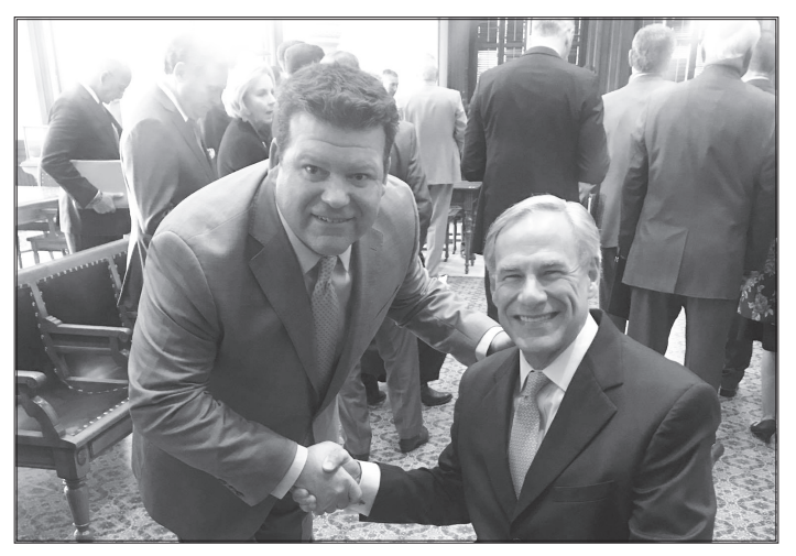
With Governor Greg Abbott.

I successfully carried multiple pieces of pro-law enforcement legislation this session. House Bill 3540 gives police officers the ability to use professional discretion when responding to minor altercations involving persons with intellectual or developmental disabilities in a group-home setting, rather than being forced to make an arrest. The tensions that result in roommate disagreements in group homes can often escalate to physical altercations. Officers often had no choice but to