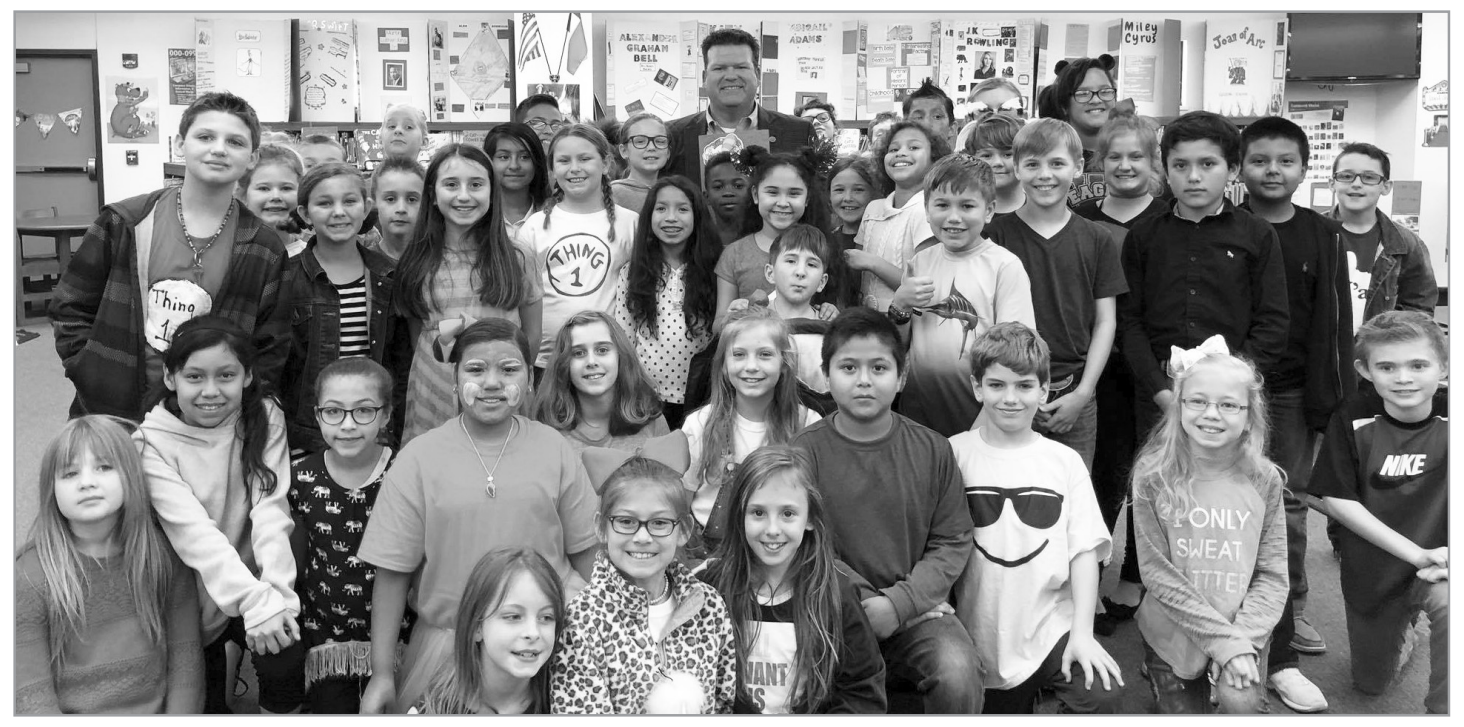
Rep. Burns at At Valley Mills Elementary - Valley Mills, Texas.

As a member of the committee that deals with public safety issues, we are regularly reminded of the tragic consequences that can occur when people drive under the influence. Addressing this problem in Texas requires the engagement of more than just patrol officers, and in response to a request from one of our locally elected Justices of the Peace, we will be filing legislation to close a loophole that effects our District and empower Justices of the Peace to save valuable time for officers, preserve crucial evidence and better address DUI arrests.