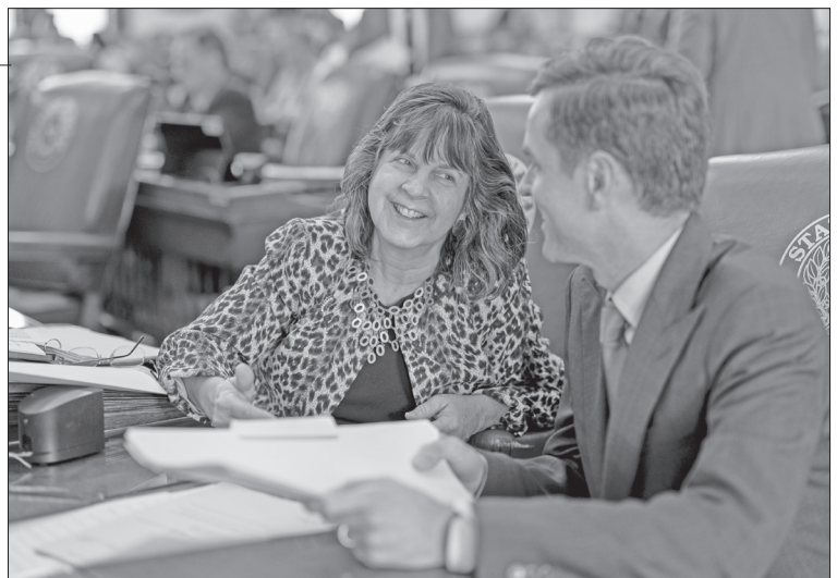
Rep. Swanson working on policy with Sen. Middleton on the House Floor.

On November 7, 2023, Texans will have the opportunity to vote on 14 proposed amendments to the Texas Constitution, including property tax relief, a cost-of-living adjustment for retired teachers, water infrastructure funding, and banning “net worth taxes.” To see the ballot order and learn more about the propositions, visit sos.state.tx.us .