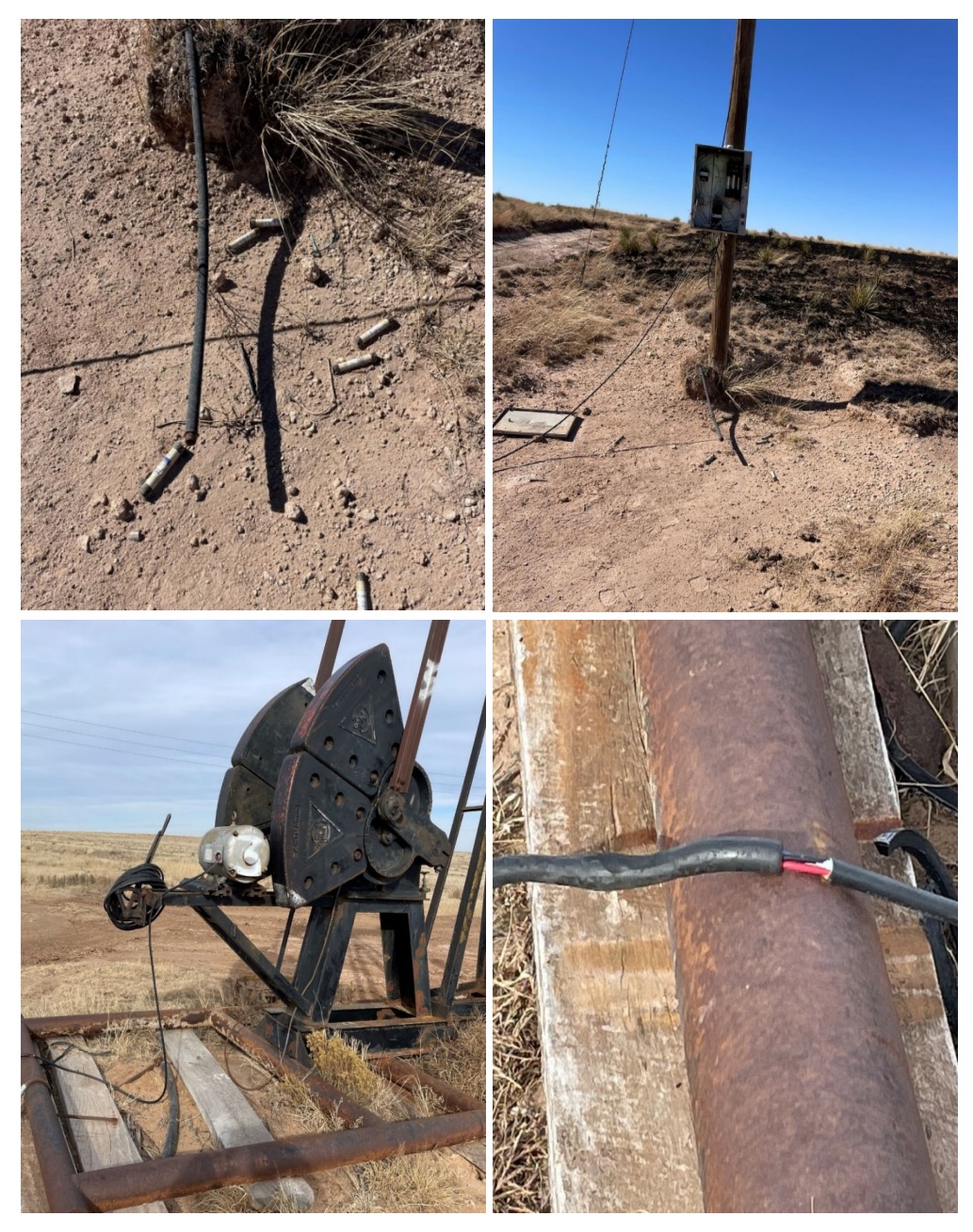
Craig Cowden presentation at hearings

Craig Cowden, a private landowner, testified that 85 percent of the multiple fires on his ranch were caused by damaged electrical infrastructure at oil and gas locations.