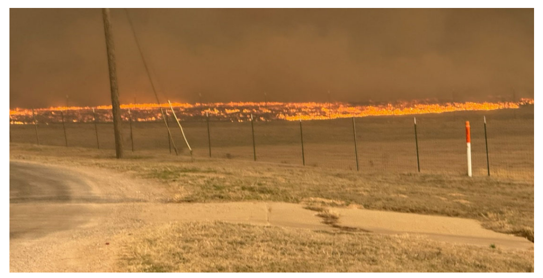
Andy Holloway presentation at hearings (AgriLife Agent, Hemphill County)

In recent years, the cost for materials and labor to install barbed wire fencing has run approximately $15,000 to $20,000 per mile depending on the terrain. With the massive increase in demand for posts, wire, supplies, and labor that will be occasioned by fencing losses on the scale experienced in the Panhandle, testimony indicated that the cost could increase to as much as $25,000 per mile. Unless a landowner had purchased insurance with a special endorsement covering fencing, those losses were entirely uninsured.