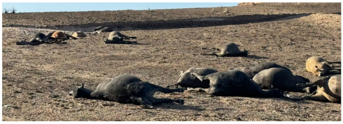
Andy Holloway presentation at hearings (AgriLife Agent, Hemphill County)

According to the Texas & Southwestern Cattle Raisers Association, approximately 15,000 individual head of cattle are known to have been lost in the wildfires. The value of cattle depends on various factors like weight, sex, age, and class. Cow-calf pairs were valued as high as $3,000 in April of 2024, with calves in the 500–600 pound range selling for $3.14 per pound and bulls at $10,000. AgriLife estimates cattle losses to be valued at $27 million.